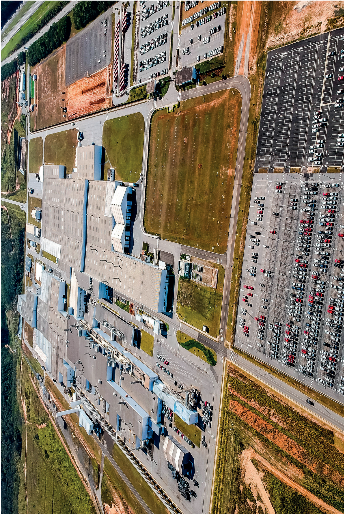
Fig. 3.1 for Question 3 A car manufacturing site in Brazil, an MIC in South America, in 2018